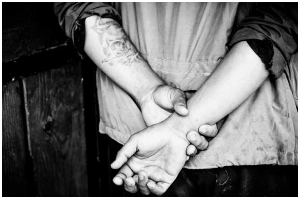
Photograph 3. Correctional Institution in Sremska Mitrovica, 2019.