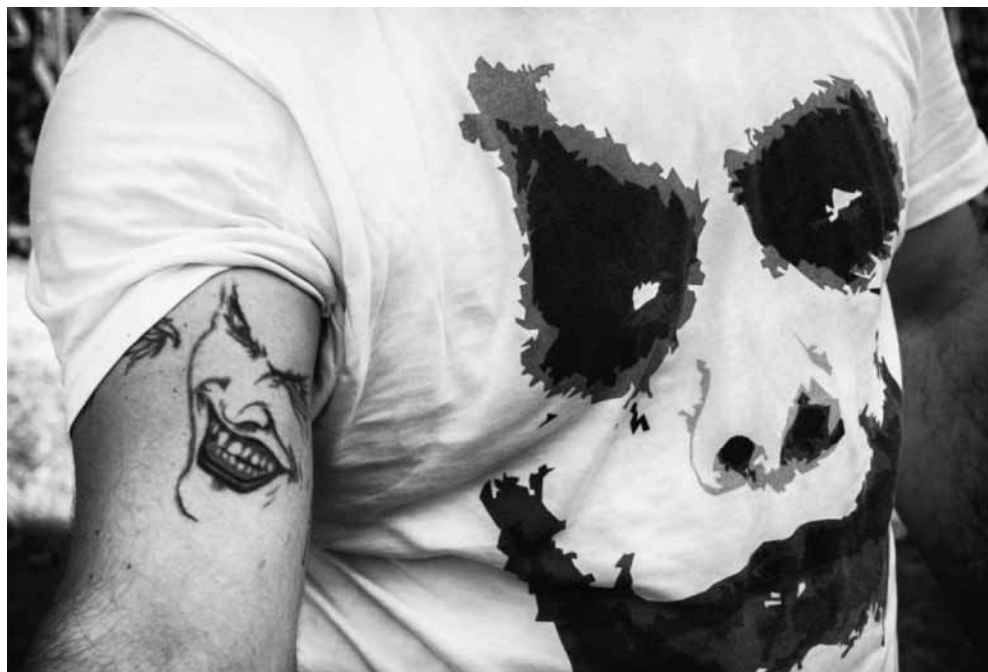
Photograph 1. Correctional Institution in Sremska Mitrovica, 2019.

Commodified prison tattoos (i.e. prison tattoos as commodified or purchased objects) include those tattoos that are used to construct prisoner's body, alongside with body-building (McCarron, 2008: 96). Namely, through marking his body with tattoos, the prisoner actually confronts the institutional marking that, just like mandatory wearing of prison uniforms, denies his individuality (McCarron, 2008: 96). Such approach to prisoners' perception of body-building and tattooing is plausibly depicted in an autobiographic novel "Record Atila" ( Dosije Atila ), written by a former prisoner Đorđe Vasiljević. When describing the process of body-building under prison conditions, he emphasizes that at that time for him, having a muscular body ornamented with prison-made tattoos represented the confirmation of his own value and the proof that the prison system did not manage to break him (Vasiljević, 2018: 206). He further confesses that he found an inmate who was willing and skilled enough to have him tattooed with a tattoo machine made from a ball pen, electric motor and batteries, using straightened and sharpened springs taken out from lighters as needles and a mixture of melted rubber slipper and shampoo as ink (Vasiljević, 2018: 206). Explaining the tattoo covering his arm and the upper part of his hand, visible even under long sleeves, he says that he deliberately chose a large tattoo that would always stand out and that could never be